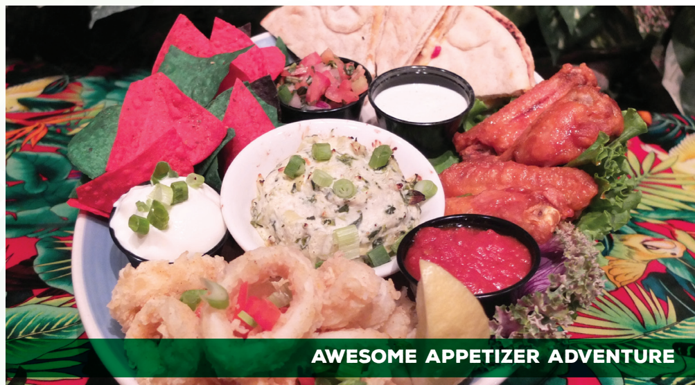
AWESOME APPETIZER ADVENTURE

A grilled all-natural vegetarian burger topped with breaded eggplant, roasted red peppers, goat cheese, lettuce and tomato. Served on a Brioche bun.