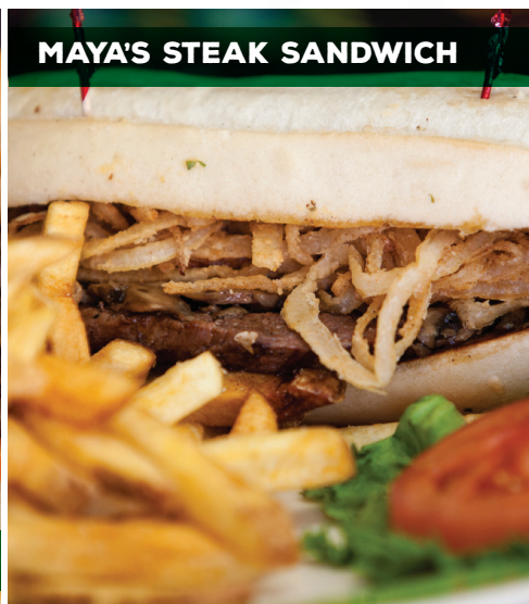
MAYA'S STEAK SANDWICH