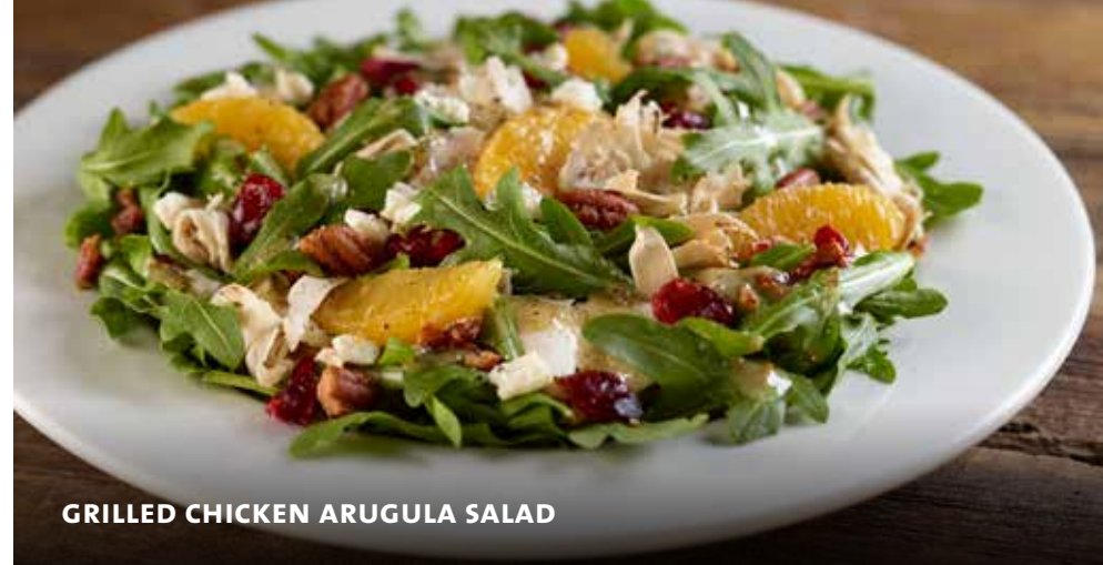
GRILLED CHICKEN ARUGULA SALAD