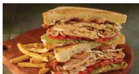
CLASSIC CLUB SANDWICH