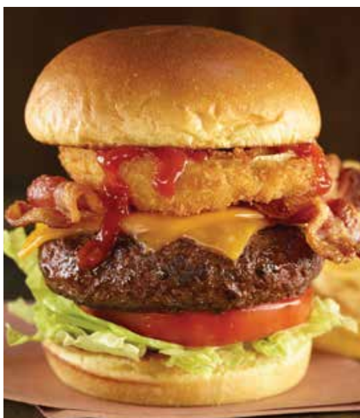
ORIGINAL LEGENDARY® BURGER

US menu pricing is based on major credit card exchange rates as of May 2019. Please note that the US cash exchange rate fluctuates and does not reflect the major credit card rate printed. Please ask your server for today's US cash house exchange rate. All prices are subject to tax and LF (Local Fee of 3.8%)