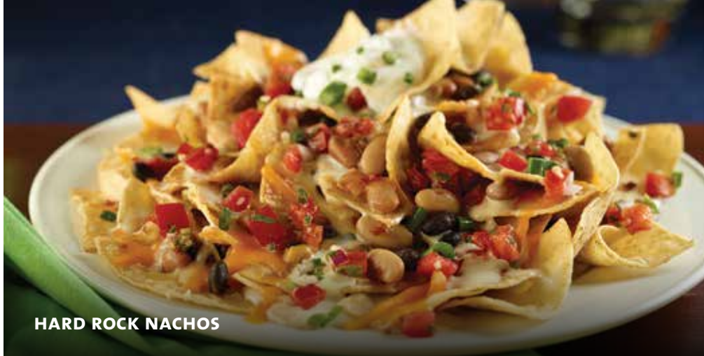
HARD ROCK NACHOS